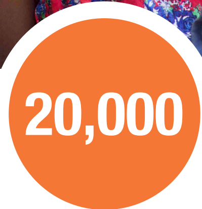
Participants in Hands of Freedom Programs

Hands of Freedom is a non-profit organization focused on helping the “untouchables” of India through micro-lending, fresh water well projects, education and savings groups.